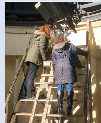
Observing Transit of Mercury in November 2019.