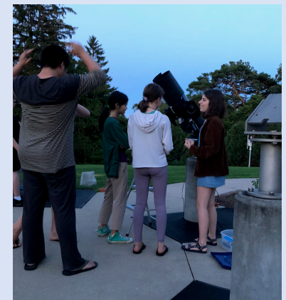
Young Astronomers Summer Experience (YASE) in 2019